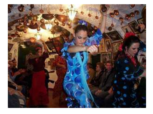
Day 3: Breakfast at hotel and then Ski Day with classes, Food Runway and this day at 16.00 hours to move us back to the hotel at 17.00 for a luxury car with driver will be waiting at the Hotel to take us to Granada to see the Alhambra and Sacromonte finishing the day with Flamenco show and dinner. After the dinner and show our driver will be waiting to take us to Hotel.