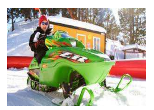
Day 5: Breakfast at the hotel and then Ski Day with classes, food courts and 16.00 hours we'll change clothes because the driver will be waiting for us to take us to Granada where we enjoy a Hamman Arabic and a show with dinner. After dinner our driver take us to the hotel.